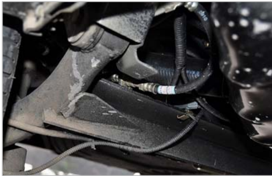
Front : MacPherson independent suspension

The chassis of MARS C6 Station Wagon is based on British ROVER chassis technology. With MacPherson independent front suspension and Twist-beam semi-independent rear suspension, it is as comfortable as a sedan yet with ground clearance \geq 210mm to cater with various road conditions.