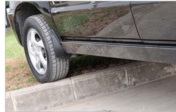
Min. Ground clearance \geq 210mm